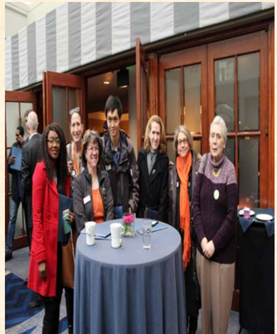
The Arc Montgomery County

The Division of Early Childhood Development's budget included $4.3 million for pre-kindergarten education. This money was added to further expand prekindergarten and helps leverage $15 million in federal grant funds to expand prekindergarten to an additional 3000 children.